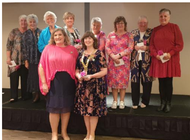
Outgoing 2021-22 National Team