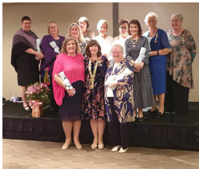
Incoming 2022-23 National Team