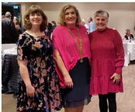
National Changeover May 28 2022 Hilton, Queenstown