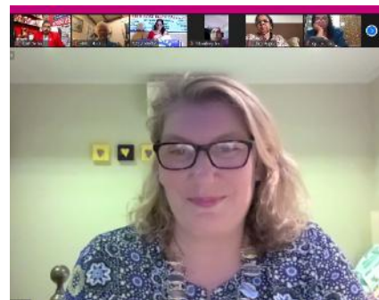
Online meeting with the IW Club of Ambala in India, District 308